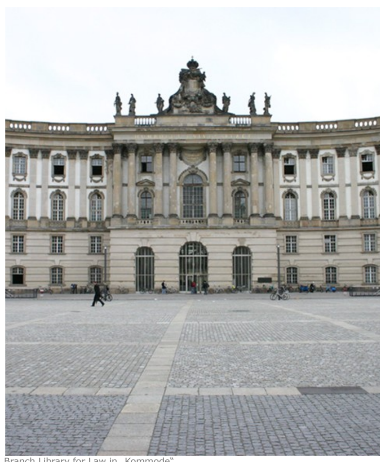
Branch Library for Law in "Kommode"