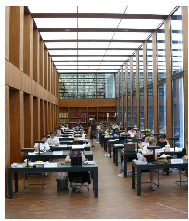
Workstations in Grimm-Zentrum; Research Reading Room