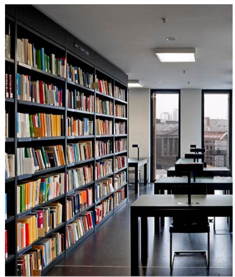
Workplaces at Grimm-Zentrum