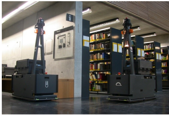
Reading room in Erwin-Schrödinger-Zentrum; Transportsation system "Hare and hedgehog"