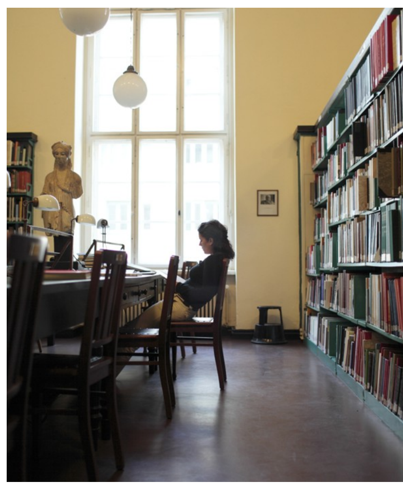
Branch Library for Classical Archaeology