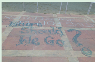
Administrative Block, JNU. June 2018