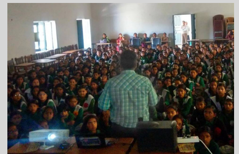
Berinag Film Festival 2016 © Cinema of Resistance

As Shweta Kishore argues 3 , in the context of independent documentary films in India, apart from the content of individual films, the nature of their circulation which often does not follow the logic of mass media distribution also contributes to the emergence of 'involved publics' around such films. In her work Kishore mentions the circulation practices of Cinema of Resistance as well. I would argue that in the case of COR, face to face interactions and embodied contact play a key role in sustaining its circulatory networks. Conversations and interactions which happen at screening venues often lead to collaborations resulting in the formation of COR screenings at new locations. Hard drives, phone numbers and email IDs get exchanged and they lead to an expansion of the screening circuit. Such exchanges do not follow the trajectory of consumption of mainstream commercial films. The exchange of films is never indiscriminate. Although technological advancements have made it easier to conduct non-commercial screenings, the censorship regulations in India make the public screening