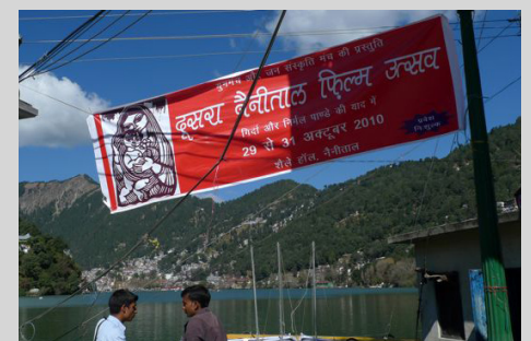
Second Nainital Film Festival