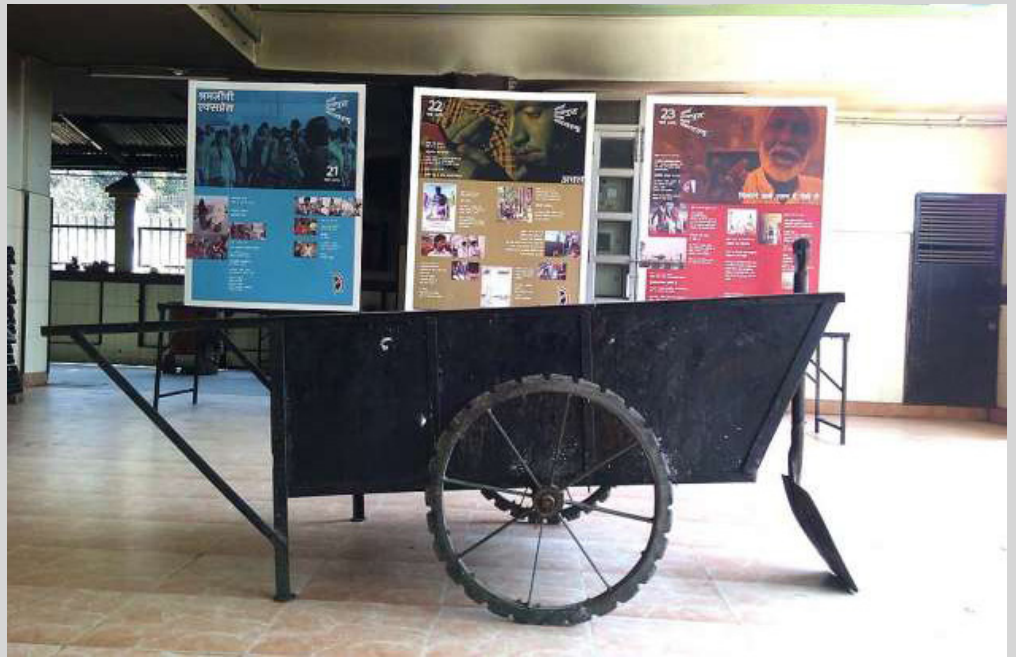
10 th Gorakhpur Film Festival © Cinema of Resistance

As Shweta Kishore argues 3 , in the context of independent documentary films in India, apart from the content of individual films, the nature of their circulation which often does not follow the logic of mass media distribution also contributes to the emergence of 'involved publics' around such films. In her work Kishore mentions the circulation practices of Cinema of Resistance as well. I would argue that in the case of COR, face to face interactions and embodied contact play a key role in sustaining its circulatory networks. Conversations and interactions which happen at screening venues often lead to collaborations resulting in the formation of COR screenings at new locations. Hard drives, phone numbers and email IDs get exchanged and they lead to an expansion of the screening circuit. Such exchanges do not follow the trajectory of consumption of mainstream commercial films. The exchange of films is never indiscriminate. Although technological advancements have made it easier to conduct non-commercial screenings, the censorship regulations in India make the public screening