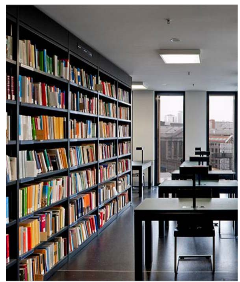
Workplaces at Grimm-Zentrum