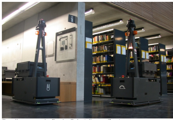
Reading room in Erwin-Schrödinger-Zentrum; Transportsation system "Hare and hedgehog"