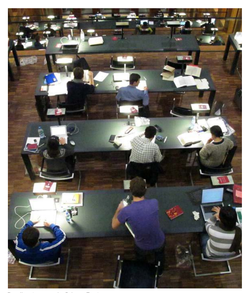
Reading terraces in Grimm-Zentrum