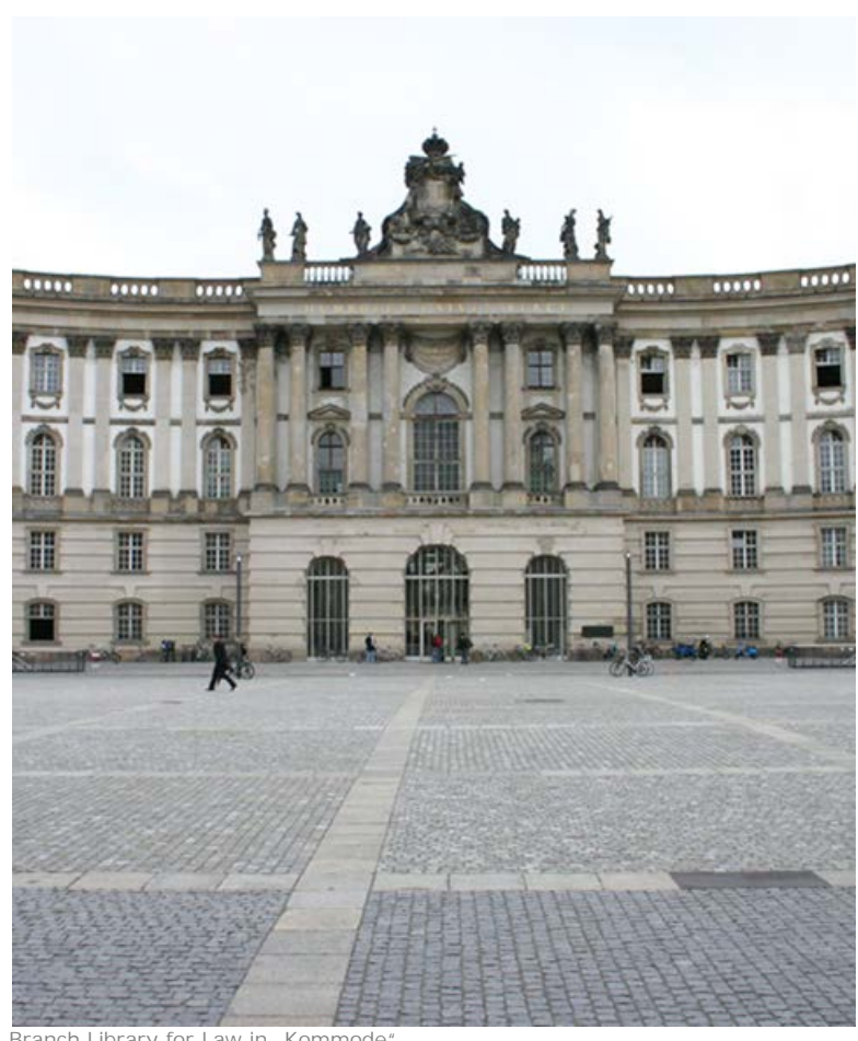
Branch Library for Law in "Kommode"