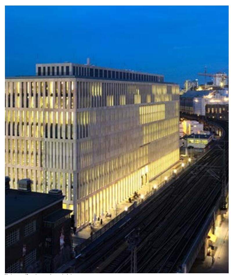
Grimm-Zentrum by night

Humboldt-Universität zu Berlin University Library